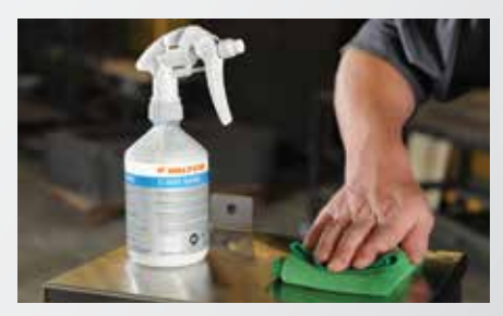
E-Nox Shine™ Order no. 53-G 403

Once you've achieved the desired finish and a passive surface, it's important to remove any dirt, dust, fingerprints, handling marks, and oils and to protect the surface. Our E-Nox Shine™ is ideal for cleaning, brightening, and protecting food processing equipment, pharmaceutical equipment, and all other types of stainless steel products.