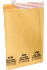
Priced per Mailer