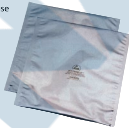
Priced per Package