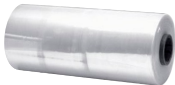
Priced per Roll