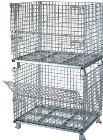
Shows 2 units stacked