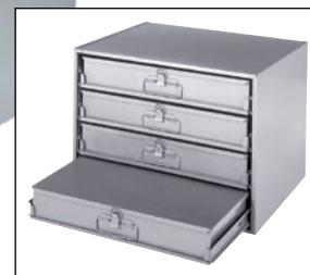
CA965 Cabinet and boxes sold separately