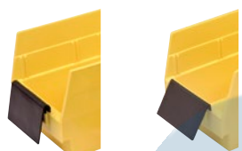
CF398 10° Angle