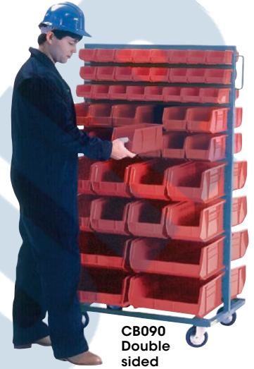
CB090 Double sided