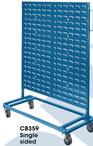
CB359 Single sided