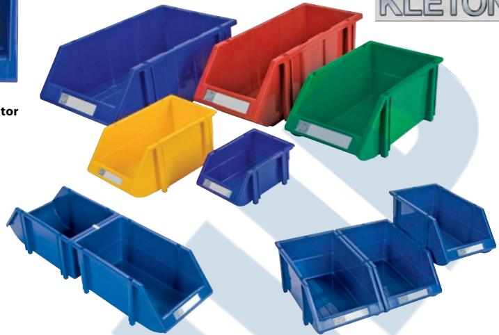
Connector clip allows for back-to-back mounting