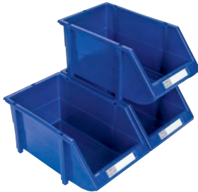
Stackable using built-in feet