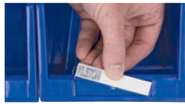
Inclined faceplate with removable label and protector