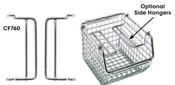
Optional Side Hangers