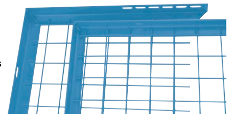
Adjustable Filler Panels

Adjustable filler panels fill in blank spots on the ends of wire mesh partitions to plug up potential security risks. Filler panels come in two sizes: 1' x 4' and 1' x 8' that slide over the ends of existing wire mesh sections. Bolt holes on the filler panels are separated per every inch and allow the filler panel to fill in a space between 6" and 10" wide. The holes line up with holes on the existing panel which are drilled in at the top and bottom to securely fasten the filler panel in two places.