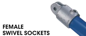
FEMALE SWIVEL SOCKETS