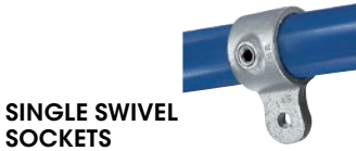
SINGLE SWIVEL SOCKETS