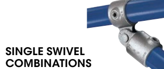
SINGLE SWIVEL COMBINATIONS