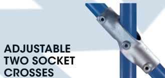
ADJUSTABLE TWO SOCKET CROSSES