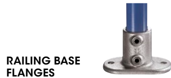
RAILING BASE FLANGES