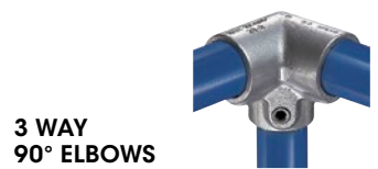
3 WAY 90° ELBOWS