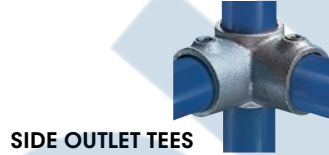
SIDE OUTLET TEES