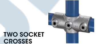
TWO SOCKET CROSSES