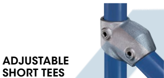
ADJUSTABLE SHORT TEES