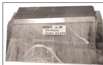
FN409 (Dividers only, partitions and cabinet not included)