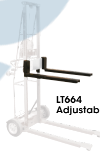
LT664 Adjustable Forks