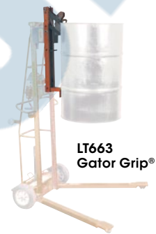
LT663 Gator Grip®