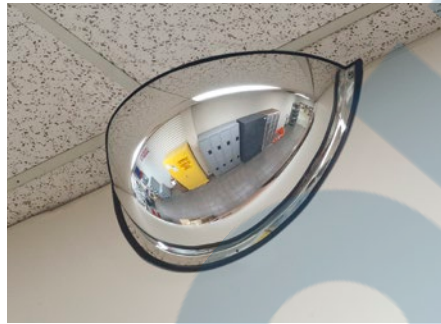
HALF DOME - 180°