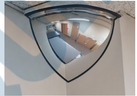
QUARTER DOME - 90°

* The dimensions listed are that of a full dome