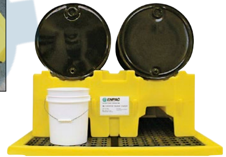
Drums, pail & pallet not included