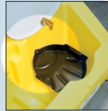
Universal® Well Liner