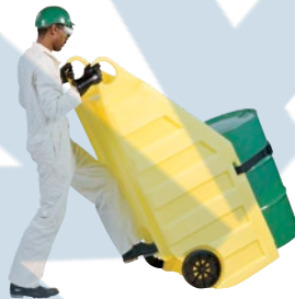
Drum not included