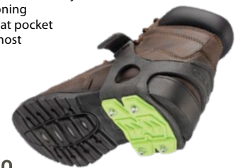
Model No. SFV130 Price/Each $