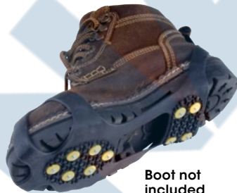
Boot not included