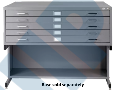
Base sold separately