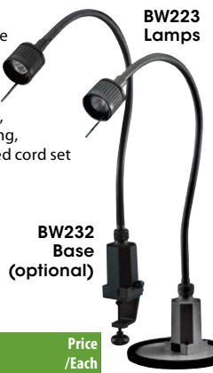
BW232 Base (optional)