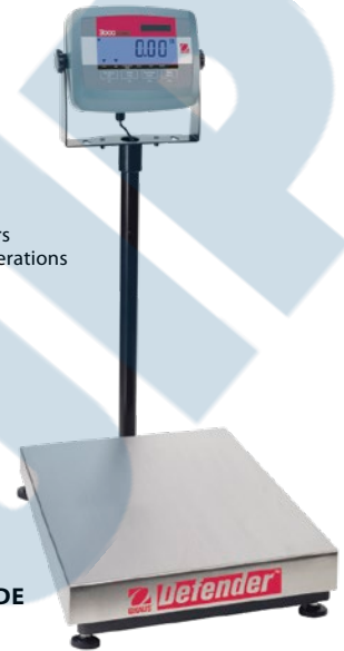
Model No. IC151 Mfg. No. 30369114 Price/Each $