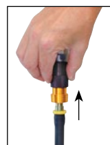
Slide the black sleeve to release downstream pressure