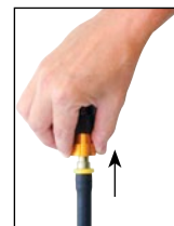
Slide the gold sleeve to release plug