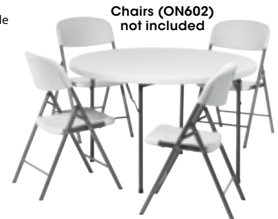
Chairs (ON602) not included