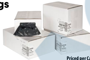
Priced per Case