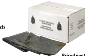
Priced per Case