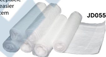
Priced per Case