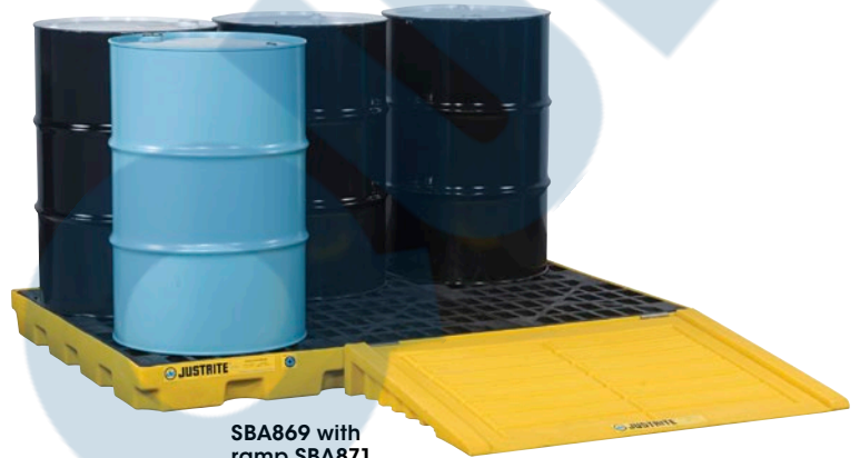
SBA869 with ramp SBA871